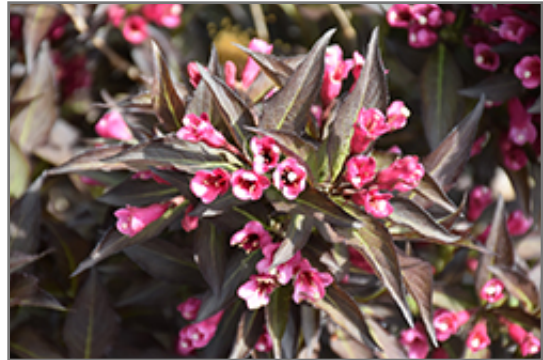
Midnight Wine Weigela flowers