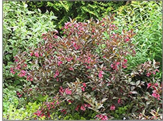
Midnight Wine Weigela in bloom