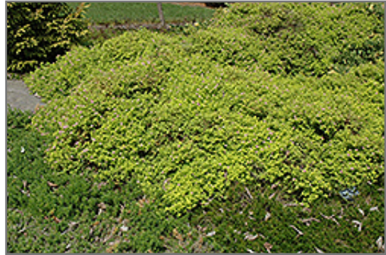
Golden Elf Spirea

Golden Elf Spirea is recommended for the following landscape applications;