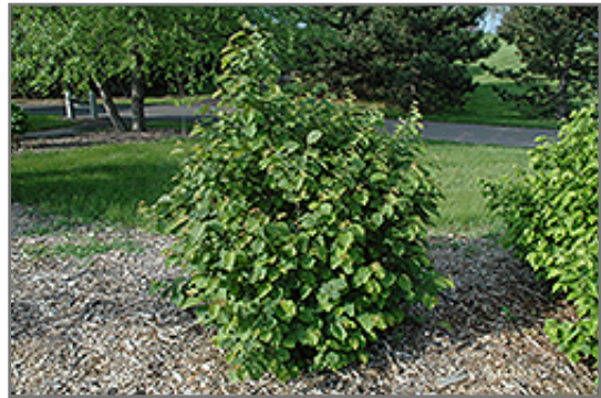
Beaked Hazelnut

Beaked Hazelnut will grow to be about 8 feet tall at maturity, with a spread of 7 feet. It tends to be a little leggy, with a typical clearance of 2 feet from the ground, and is suitable for planting under power lines. It grows at a medium rate, and under ideal conditions can be expected to live for approximately 30 years. While it is considered to be somewhat self-pollinating, it tends to set heavier quantities of fruit with a different variety of the same species growing nearby.