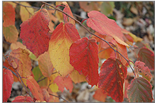
Beaked Hazelnut in fall

This is a multi-stemmed deciduous shrub with an upright spreading habit of growth. Its average texture blends into the landscape, but can be balanced by one or two finer or coarser trees or shrubs for an effective composition. This plant will require occasional maintenance and upkeep, and can be pruned at anytime. It is a good choice for attracting squirrels to your yard. Gardeners should be aware of the following characteristic(s) that may warrant special consideration;