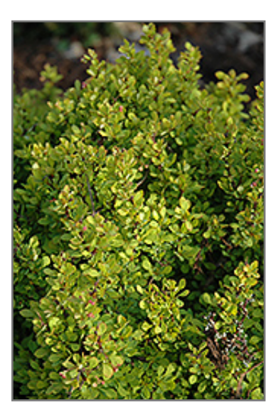
Golden Nugget Japanese Barberry foliage