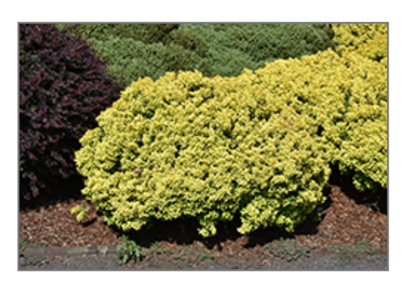
Golden Nugget Japanese Barberry

Golden Nugget Japanese Barberry is recommended for the following landscape applications;