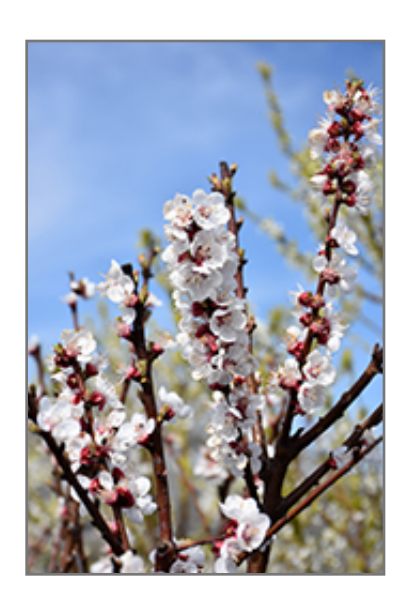
Tilton Apricot (dwarf) flowers

Tilton Apricot (dwarf) is draped in stunning clusters of fragrant white flowers along the branches in early spring, which emerge from distinctive crimson flower buds before the leaves. It has green deciduous foliage. The pointy leaves turn yellow in fall. The fruits are showy gold drupes with a red blush, which are carried in abundance in mid summer. The fruit can be messy if allowed to drop on the lawn or walkways, and may require occasional clean-up.