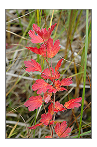
American Gooseberry in fall