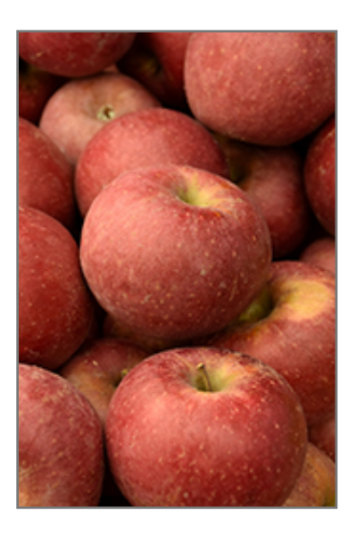
Winesap Apple fruit