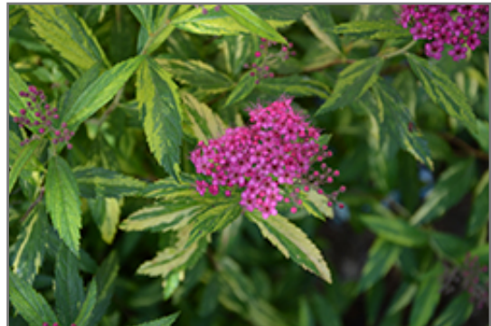
Double Play Painted Lady Spirea flowers