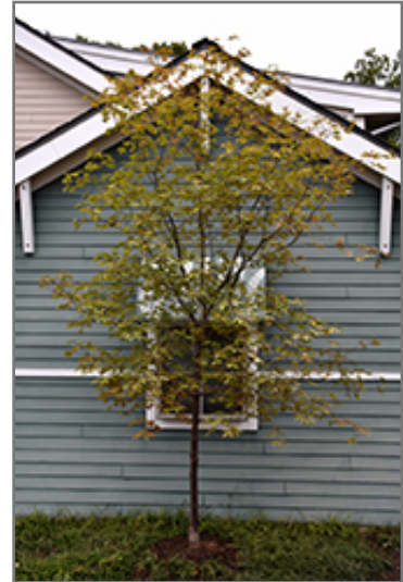
Cinnamon Girl Paperbark Maple in fall