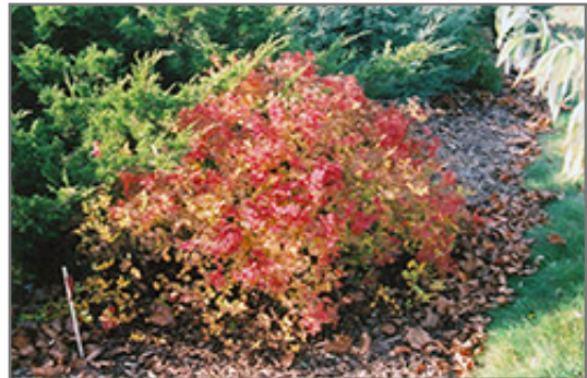
Golden Princess Spirea in fall