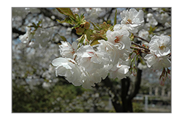
Mt. Fuji Flowering Cherry flowers

Mt. Fuji Flowering Cherry is a deciduous tree with a shapely oval form. Its average texture blends into the landscape, but can be balanced by one or two finer or coarser trees or shrubs for an effective composition.