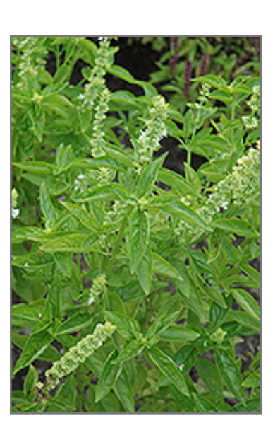
Sweet Italian Basil flowers

This plant is quite ornamental as well as edible, and is as much at home in a landscape or flower garden as it is in a designated herb garden. It should only be grown in full sunlight. It prefers to grow in average to moist conditions, and shouldn't be allowed to dry out. It is not particular as to soil type or pH. It is somewhat tolerant of urban pollution. This is a selected variety of a species not originally from North America. It can be propagated by cuttings; however, as a cultivated variety, be aware that it may be subject to certain restrictions or prohibitions on propagation.