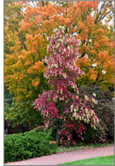
Sourwood in fall

* This is a 'special order' plant - contact store for details