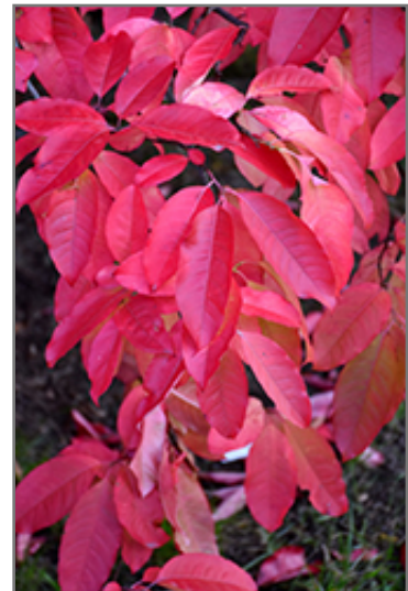
Sourwood in fall