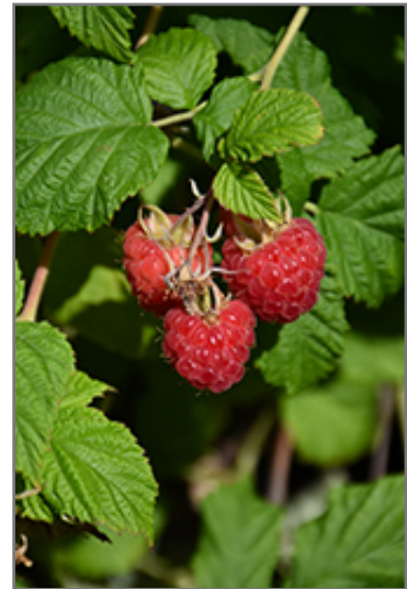
Raspberry Shortcake Raspberry fruit

Raspberry Shortcake Raspberry has rich green deciduous foliage on a plant with an upright spreading habit of growth. The textured oval compound leaves do not develop any appreciable fall color. It features an abundance of magnificent red berries in mid summer.