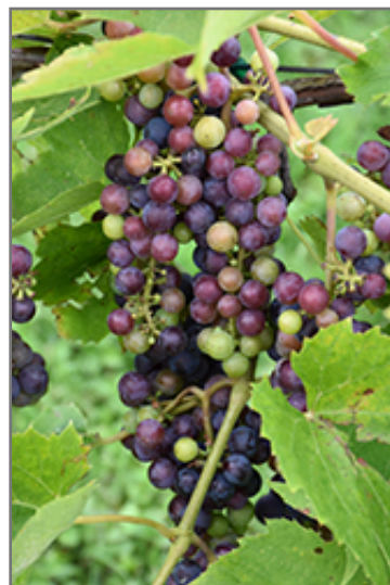
St. Croix Grape fruit

St. Croix Grape has rich green deciduous foliage on a plant with a spreading habit of growth. The lobed leaves turn yellow in fall. It produces small clusters of deep purple grapes with powder blue overtones in mid fall.