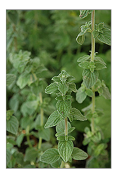
Za'atar Marjoram foliage

Aside from its primary use as an edible, Za'atar Marjoram is sutiable for the following landscape applications;