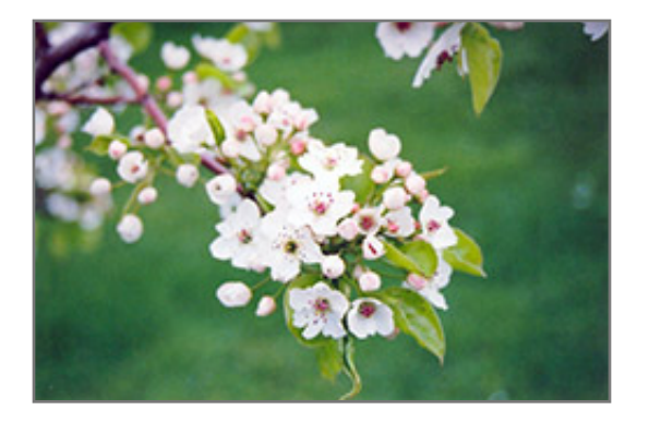
Luscious Pear flowers

This is a dense deciduous tree with a shapely oval form. Its average texture blends into the landscape, but can be balanced by one or two finer or coarser trees or shrubs for an effective composition. This is a high maintenance plant that will require regular care and upkeep, and is best pruned in late winter once the threat of extreme cold has passed. Gardeners should be aware of the following characteristic(s) that may warrant special consideration;