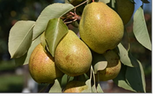
Luscious Pear fruit

Height: 45 feet Spread: 30 feet Sunlight: O Hardiness Zone: 4a Other Names: Common Pear Description: