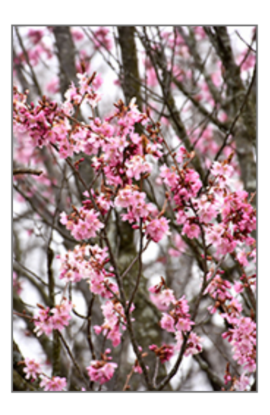
Columnar Sargent Cherry flowers