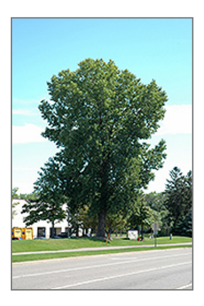
Siouxland Poplar