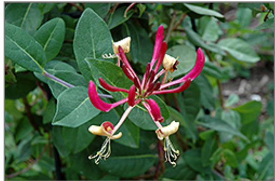
Peaches And Cream Honeysuckle flowers

Peaches And Cream Honeysuckle is recommended for the following landscape applications;