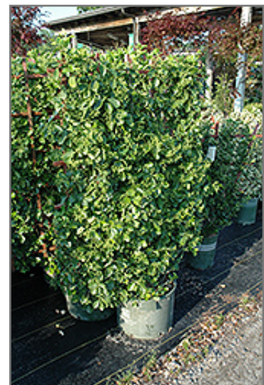
Manhattan Spreading Euonymus