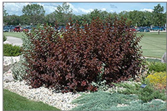
Diablo Ninebark