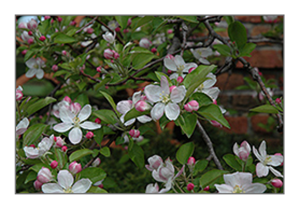
Golden Delicious Apple flowers