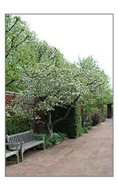
Golden Delicious Apple in bloom

This tree is typically grown in a designated area of the yard because of its mature size and spread. It should only be grown in full sunlight. It prefers to grow in average to moist conditions, and shouldn't be allowed to dry out. It is not particular as to soil type or pH. It is highly tolerant of urban pollution and will even thrive in inner city environments. This particular variety is an interspecific hybrid.