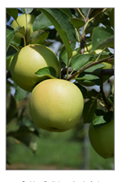
Golden Delicious Apple fruit

Golden Delicious Apple features showy clusters of lightly-scented white flowers with shell pink overtones along the branches in mid spring, which emerge from distinctive pink flower buds. It has forest green deciduous foliage. The pointy leaves turn yellow in fall. The fruits are showy chartreuse apples with yellow overtones, which are carried in abundance in mid fall. The fruit can be messy if allowed to drop on the lawn or walkways, and may require occasional clean-up.