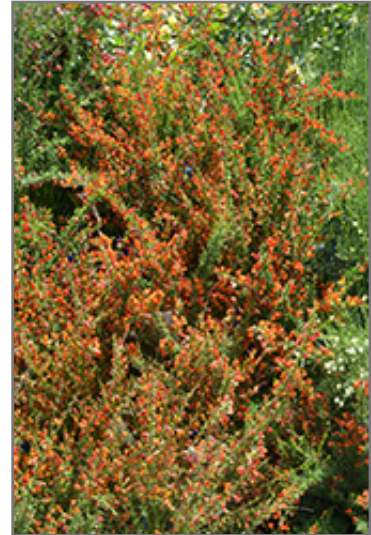
Lena Scotch Broom in bloom

This shrub should only be grown in full sunlight. It prefers dry to average moisture levels with very well-drained soil, and will often die in standing water. It is considered to be drought-tolerant, and thus makes an ideal choice for xeriscaping or the moisture-conserving landscape. It is particular about its soil conditions, with a strong preference for clay, alkaline soils, and is able to handle environmental salt. It is highly tolerant of urban pollution and will even thrive in inner city environments. This particular variety is an interspecific hybrid.