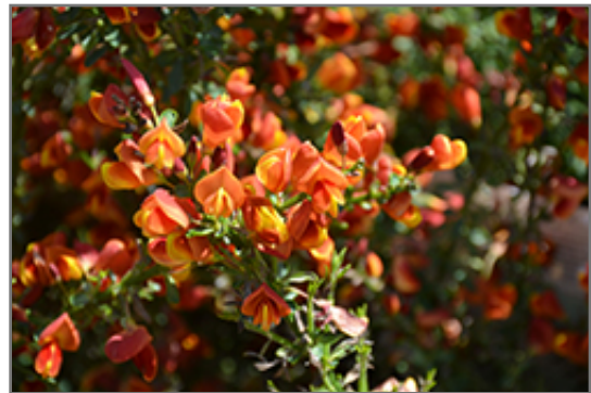
Lena Scotch Broom flowers